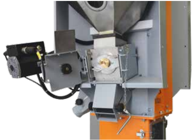
One-sided bearing mounted dosing screw with quick release connection