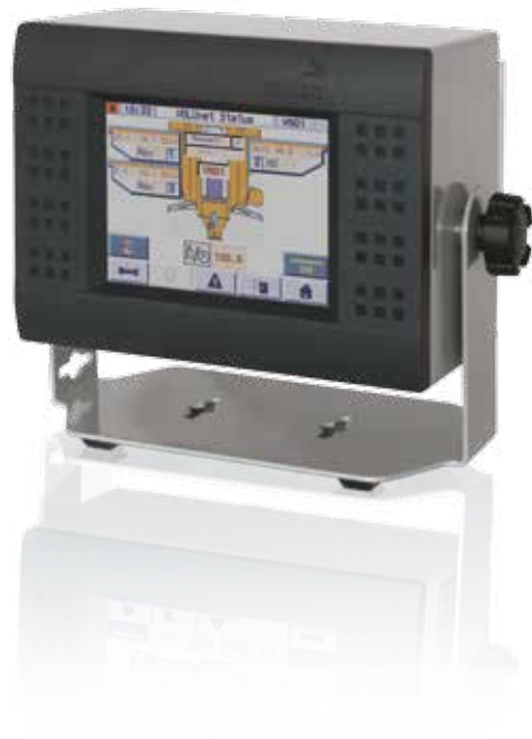
VOLUnet SC control

motan's unique gravity-mixing principle offers a high level of mix consistency of the components before they reach the extruder. This plays a key role in achieving perfect plasticisation and homogenisation of the materials.