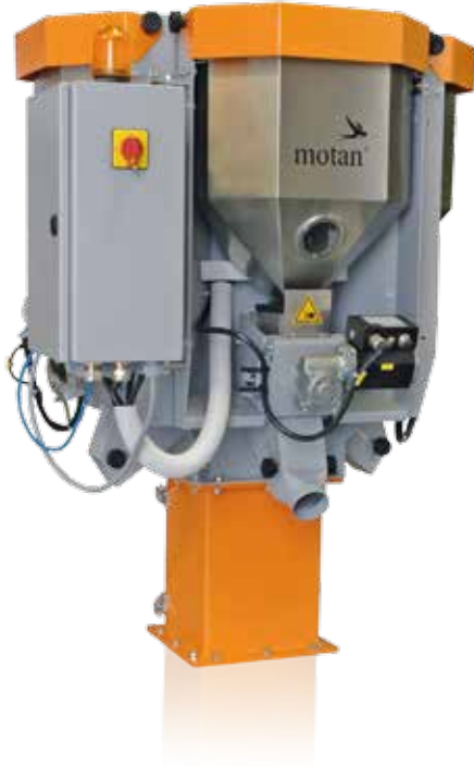
SPECTROCOLOR V with 10L collecting bin and three dosing modules