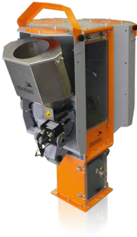
Quick change system