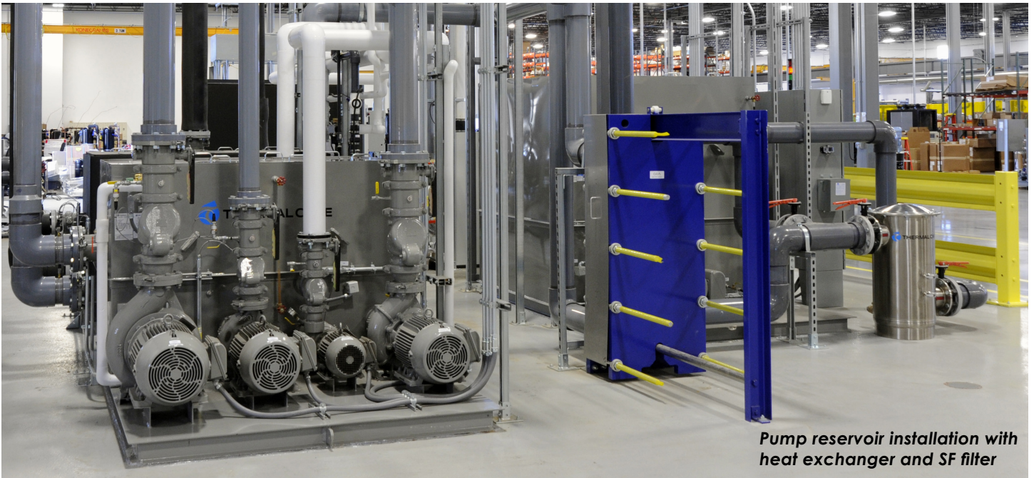
Pump reservoir installation with heat exchanger and SF filter